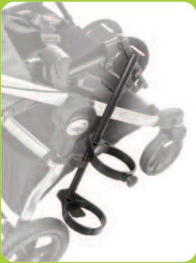
O2 Cylinder Holder