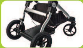
Battery, Vent or Utility Tray