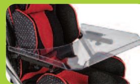
Upper Extremity Support Tray Angle/depth adjustable hardware included