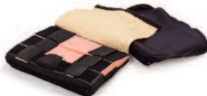
Adjustable Contour Seat