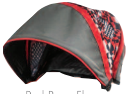
Red Race Flags

Each color is available in either Cross Over or Center Stripe style.