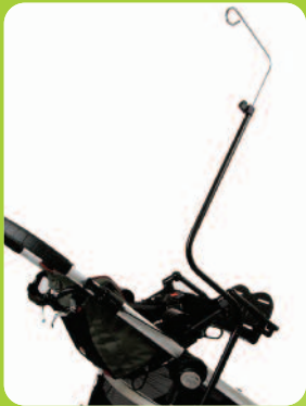
IV Support Pole