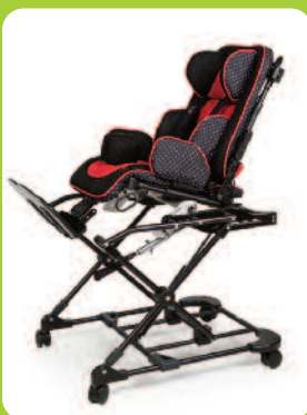
Folding Booster Base Height Adjustable