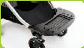
Front Mount Utility Platform