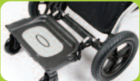
Rear Accessory Platform