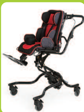
JCM Hi-Lo Base Height Adjustable

The Zippie Voyage is available with options designed to make daily tasks a breeze.