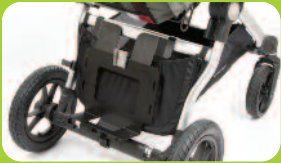
LTV/Trilogy Ventilator Hardware Dovetail vertical frame-mounted hardware